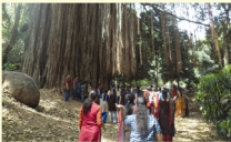
Day with Nature at Kallar