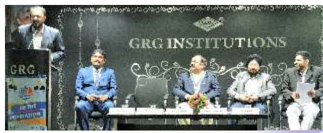
RYLA Inaugural Function

'Rotary Youth Leadership Awards' organized by Rotary Club of Coimbatore Uptown for students on 5 January 2019.